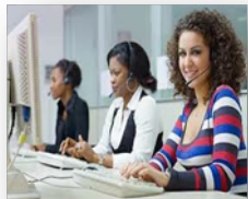
Help Call Center