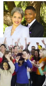
Happy, successful, and blessed families!