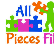
All find their place