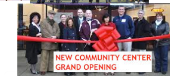
Strategies for Living Free