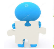
Each piece, one