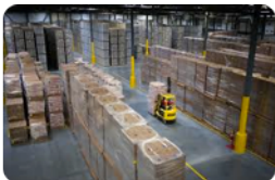
More than enough Food