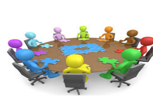
Collaboration of Partners