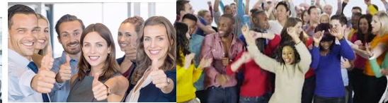
We are celebrating and celebrated in Community!