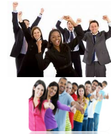
Ambassador Servant Leaders & Volunteers/ Partnerships