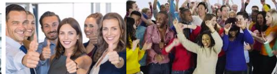
We are celebrating and celebrated in Community!