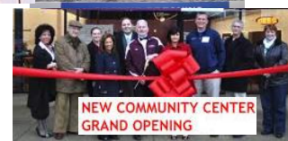
NEW COMMUNITY CENTER GRAND OPENING