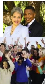
Strategies for Living Free