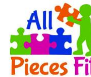
All find their place