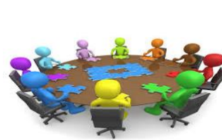
Collaboration of Partners