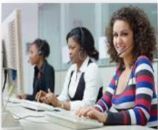
Help Call Center