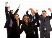
Grant Writing Team