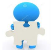
Each piece, one piece