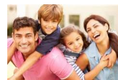
Happy, successful, and blessed families!